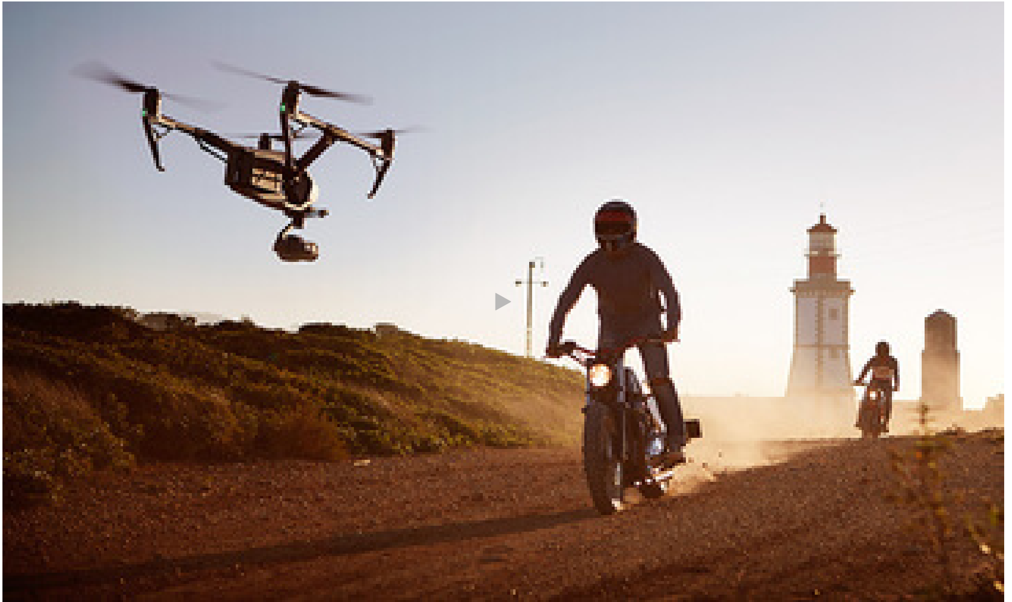
DJI - Riders: A Short Film Shot with the Zenmuse X7