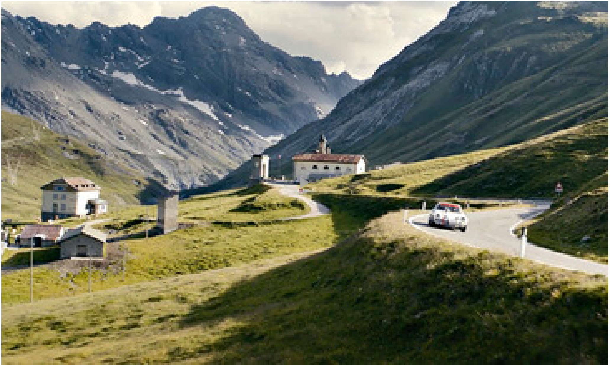
DJI - Stelvio Pass: A Short Film Shot on the Zenmuse X7