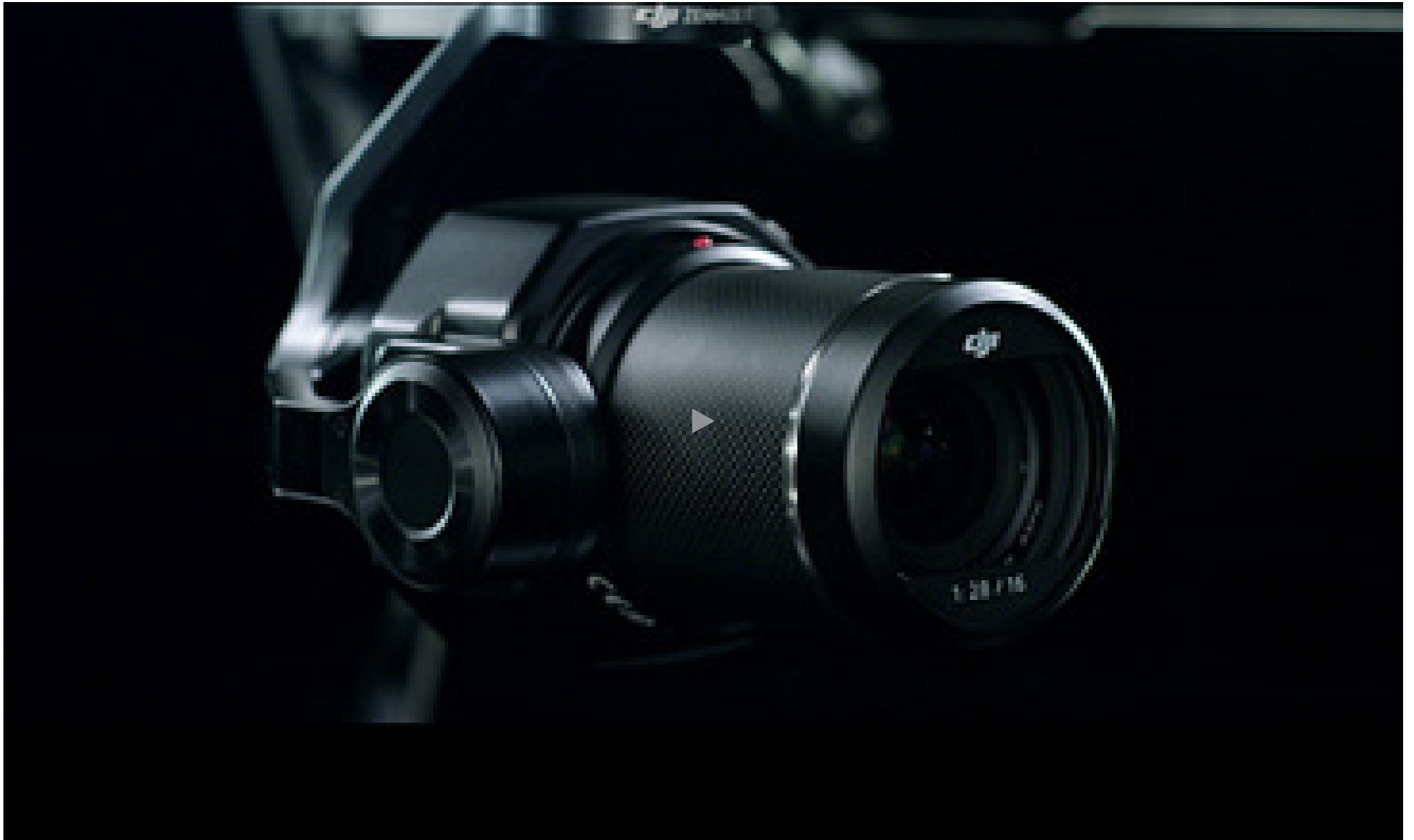
DJI - Introducing the Zenmuse X7